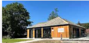
Garden Terrace café