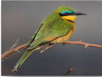
Little Bee Eater