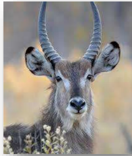
Water Buck Antelope