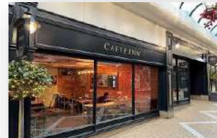
Caffelnn (Florence Walk)

REMEMBER to show your Membership Card. Many members have still not collected their cards at the monthly meetings. NO CARD.....NO 15% DISCOUNT