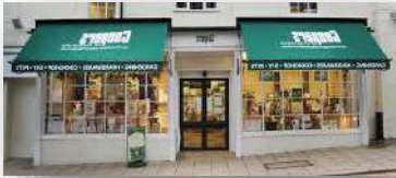
Coopers – Bridge Street

We are very grateful to the following traders in Bishops Stortford for their generous offers of discounts for our u3a members. All these offer a discount of 15%